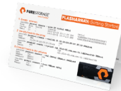
No manual required