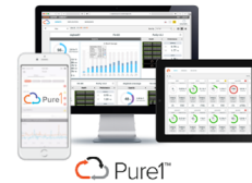
AI-driven cloud support, management, and analytics